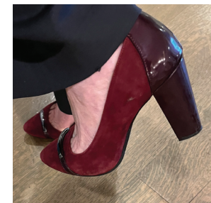
Les high step doodlepoppers!