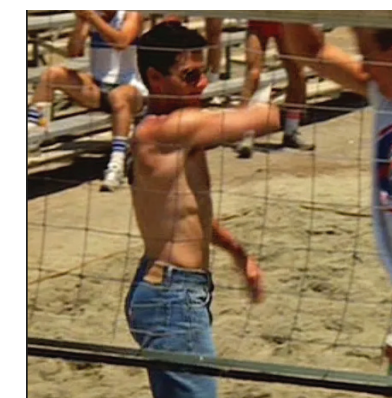
Volleyball in Jeans