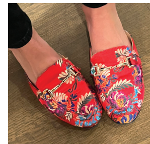
Asian Annie Flats of fire!

Stylish footwear never goes out of style at Rotary. Spotted last week these delightful styles for your foot pleasure.