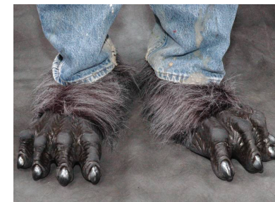
Moiph gnarly dogs old guy feet