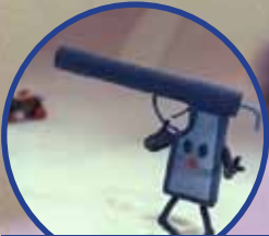
Grumpy Jelly Jones