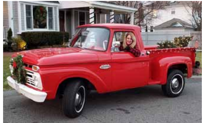
Prizes delivered in vintage Holiday vehicle. (Blond not included)